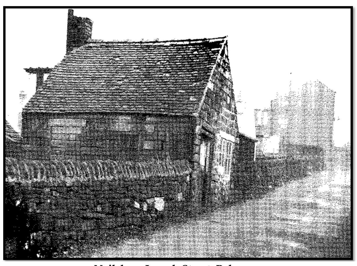
Nailshop, Joseph Street, Belper