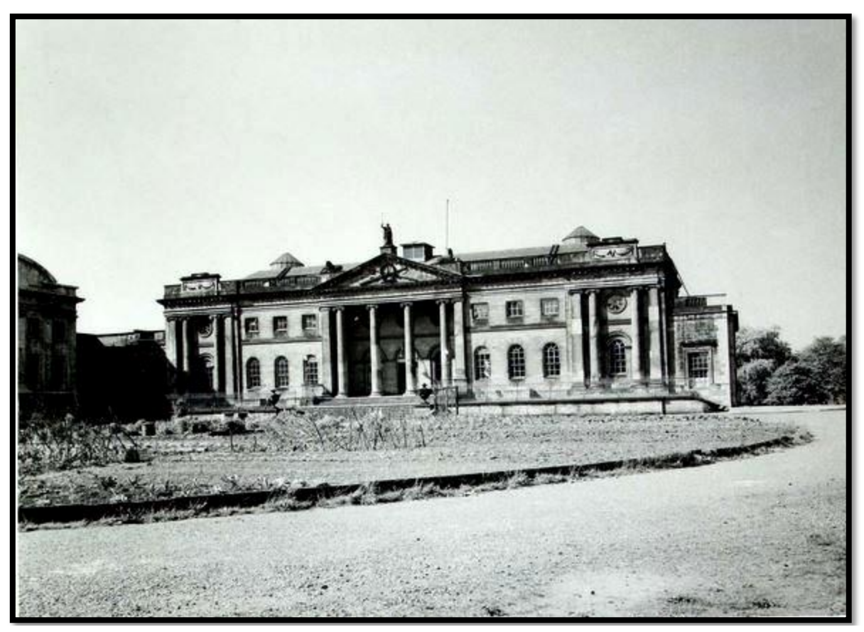
York Assize Court

Such was the version of the story carried by the local newspapers. All that one can add is that the verdict must have split opinion in the village, because we have learned from the evidence given in court that Thorpe Hesley was home, not only to the Hattersleys and the Butchers, but originally to the Watsons as well.